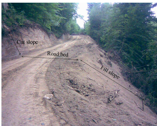
Fig. 1: Components of the forest road cross section

section components. A better understanding of the effects of hillside gradient on forest road cross sections, product recovery and financial return will help improve forest road construction practices based on management goals.