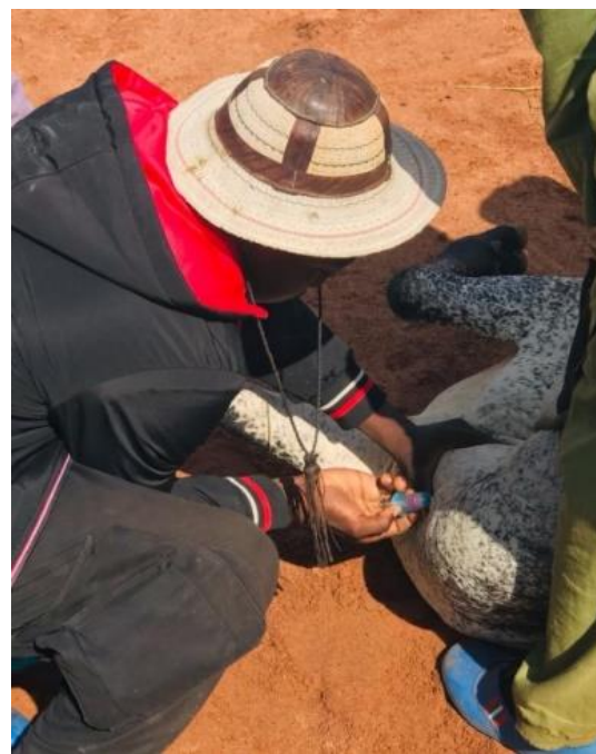
Fig. 3: Blood sampling collection from cattle jugular vein (Banizounbou, Malanville, North of Benin)