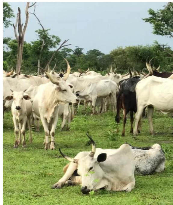
Fig. 2: A cattle herd (Banizounbou, Malanville, North of Benin)

antibodies and brucellosis was estimated by dividing the number of positive sera by the number of sera tested. The sex-specific prevalence for each disease was estimated and compared by pairing it with the z-test on R software. The confidence level for this test was 5%.