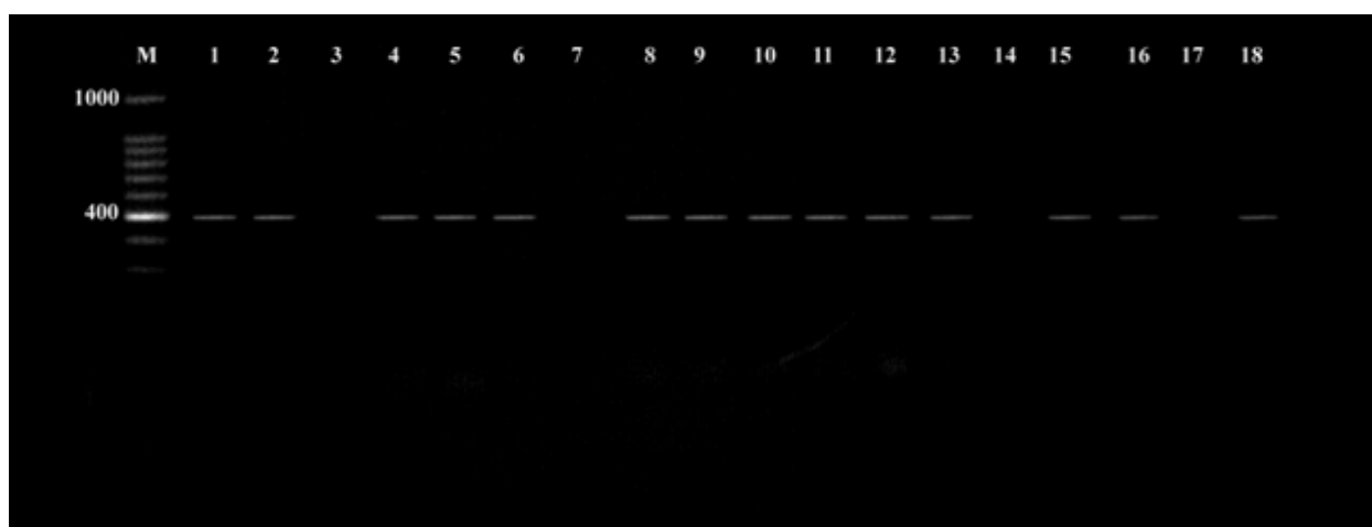
Fig. 4. The amplified CagA gene sequence for biopsy specimens. Agarose gel (1%) electrophoresis of PCR amplification of CagA gene fragment. Lane M: For 1 kb DNA ladder marker