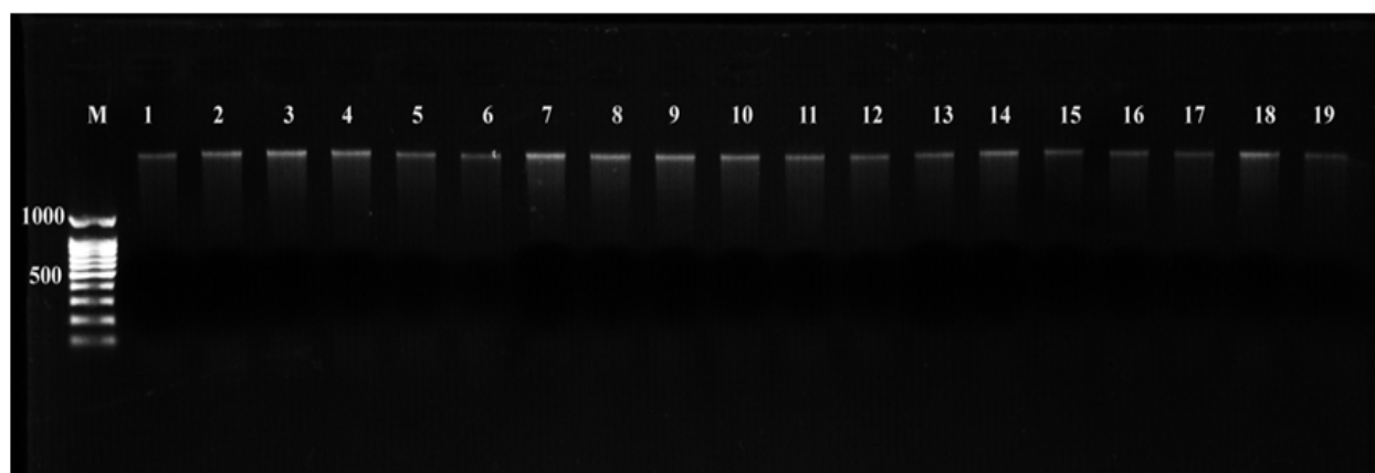
Fig. 3. Genomic DNA extraction from biopsy specimens of 19 gastric maladies patients Agarose gel (1%) electrophoresis of genomic DNA extracted from 19 gastric biopsies, lane M: For 1 kb DNA ladder marker