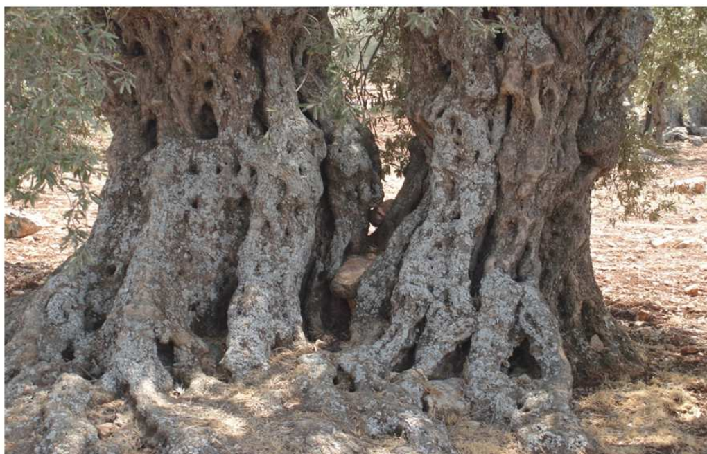
Fig. 1. Old Romans olive tree in Jordan/Ajlun Alhashmeah

Olive oil under transition period at Ajlun Governorte showed high percentage of Oleic acid (67.49%), Palmitic acid (11.82%), linoleic acid (13.31), Stearic acid and (4.35%) and organic olive oil at Burma Station of oleic acid (68.88%) palmatic acid (12.54%), linoleic acid (11.73%), Stearic acid and (3.97%) Fig. 2 .