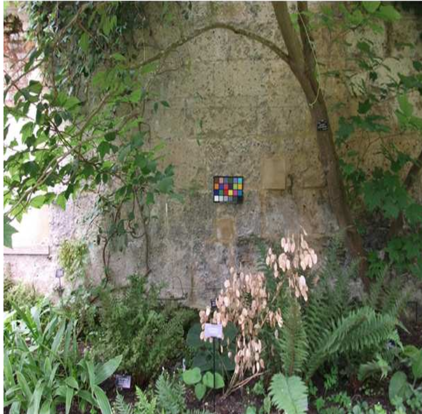
Fig. 2. Encrustation visible at Site 2 (west-facing), where average RMS roughness was relatively high

It is noteworthy that encrustation evident at some sites (Site 2, appearing in Fig. 2) could enhance surface roughness. Also, pitting could augment depth values and Thornbush (2014c) previously observed that pit depth actually decreased (westwards) along this border wall (see her Fig. 1ib). Finally, more sites would have helped to elucidate the strength of the correlation between the different methods.