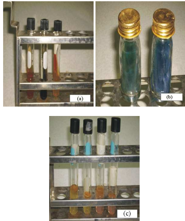
Fig. 1: Appearance of KIA, MIU and Simmon citrate after inoculating with revertant strains of E. coli 0157:H7. (a) Kliger Iron Agar (KIA) media; (b) Simmon citrate media; (c) Motility Indole Urea (MIU) media

Figure 2 showed the various aberrations observed in the root cells of the Allium cepa . Most of the aberrations were observed at the Anaphase stage of mitotic division. Some of the chromosomes were linked together instead of separating to the poles forming bridges and fragments. There was also a lag observed in the chromosomal migration to the poles (Fig. 3).