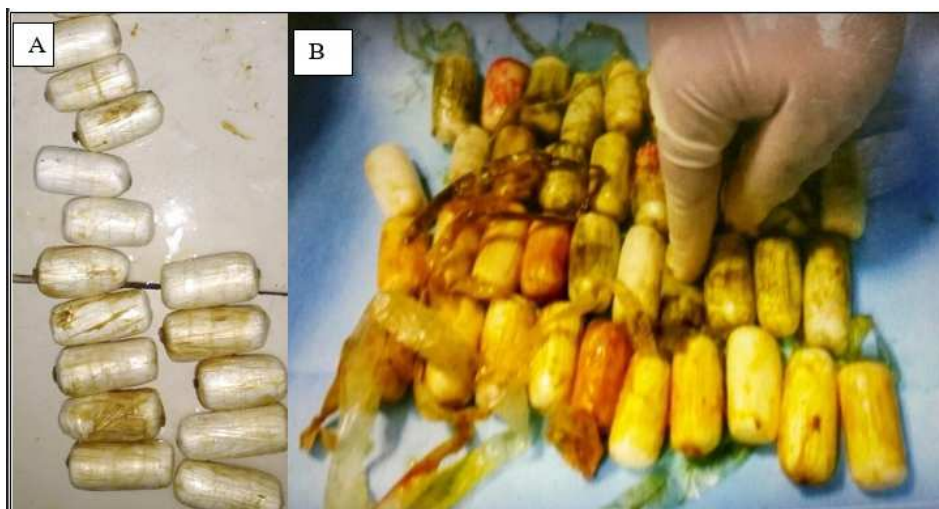
Fig. 2. (A) Multiple oblong shaped intact Heroin packets passed in stool, (B) similar packets removed after laparotomy with few of them ruptured