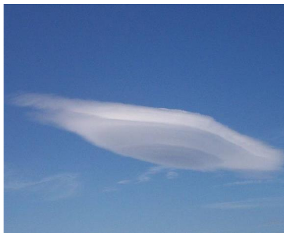
Fig. 2. Lenticular clouds have in some cases been reported as UFOs due to their peculiar shape.

UFOs have become a dominant theme in modern culture, making phenomena treated from a sociological and psychological point of view.