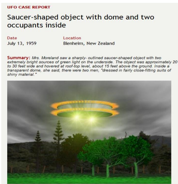
Fig. 4. 1959, Fly saucer reported in Blenheim, New Zealand.