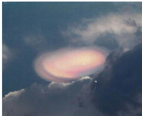
Fig. 1. Unusual atmospheric occurrence observed over Sri Lanka in 2004.

The gap left by the lack of institutional science research has given rise to researchers and independent groups, including the NICAP in the mid-twentieth century and more recently to the UFO Mutual UFO Network and the UFO Study Center (Center for UFO Studies). The term "UFOlogy" is used to describe the collective efforts of those studying the reports and evidence associated with unidentified flying objects.