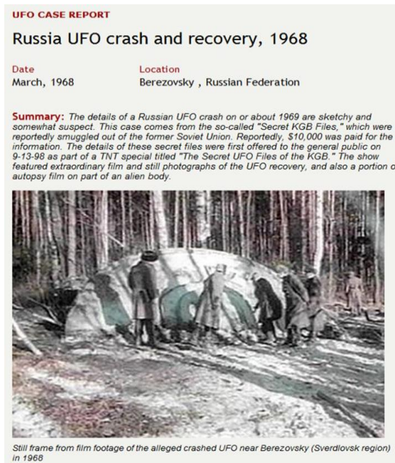
Fig. 5. 1968, Russia UFO crash in Berezovsky

Unfortunately, the physics we master today does not allow us to build such super-performance accelerators.