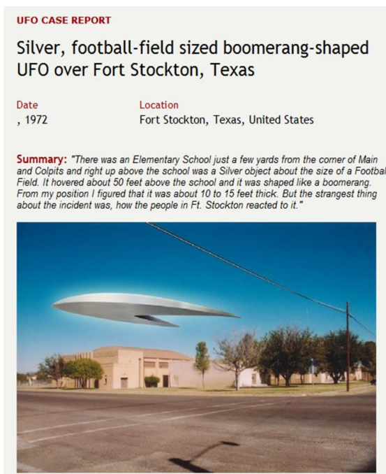
Fig. 6. 1972, UFO over Fort Stockton, Texas.

Until we master an advanced technique up to such a level, we can replace particle accelerators with very high-power lasers and repeated impulses at extremely low intervals.