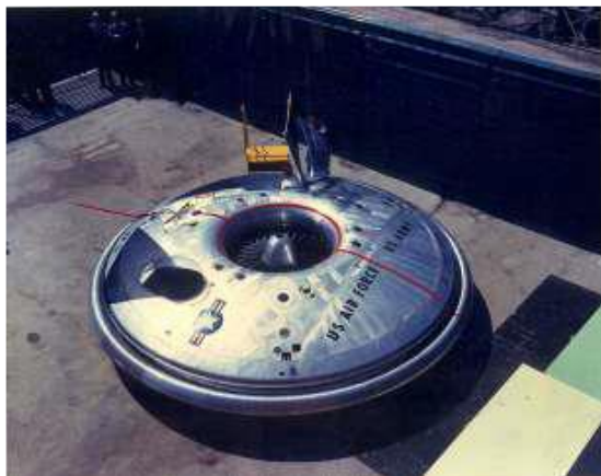
Fig. 12. The Avro Canada VZ-9 Avrocar was a VTOL aircraft developed by Avro Aircraft Ltd. (Canada). The Avrocar intended to exploit the Coanda effect to provide lift and thrust from a single "turborotor" blowing exhaust out the rim of the disk-shaped aircraft to provide anticipated VTOL-like performance.

Another important observation is that after the Second World War we started to build modern flying ships with many capabilities that can easily be confused with an alien ship (Fig. 12).