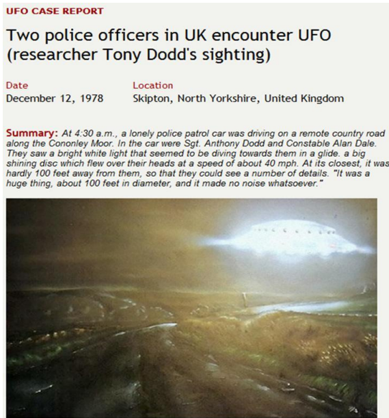
Fig. 7. 1978, UFO over Skipton, North Yorkshire, United Kingdom. Source: http://www.beamsinvestigations.org/Police%20Officers%20in%20Skipton,%20North%20Yorkshire,%20UK%20UFO%20Encounter%20December%2012,%201978.htm