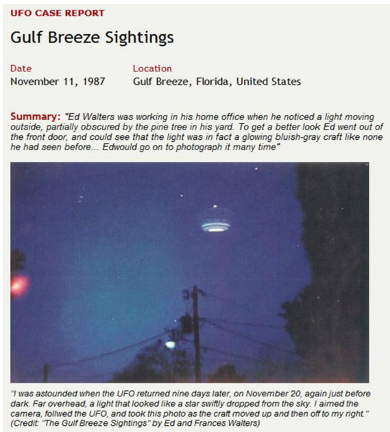
Fig. 8. 1987, UFO over Gulf Breeze, Florida, US