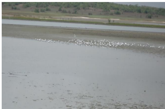
Fig. 2: Lagoon serving as home to migratory birds Source: Adopted from Dadson (2012)

Animals including the deer. The respondents indicated that most of these animals have either migrated or become extinct. According to the respondents, this has affected the celebration of the festival over the last few years. It is important to note that the celebration of the festival attracts people within and outside the country. This has brought about significant development to the municipality and by extension the country as a whole. The destruction of the vegetative cover, therefore, means that the tourism potential of the festival is under threat. The views of the respondents were corroborated by an interview with a 58-year fisherman in the area who noted that "The traditional council is planning of finding another alternative animal in place of the deer to be used for the sacrifice. It is not easy to hunt for the dears in this forest again. All the abodes of the dears have been cleared for building purposes".