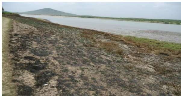
Fig. 3: Bushfire around the lagoon