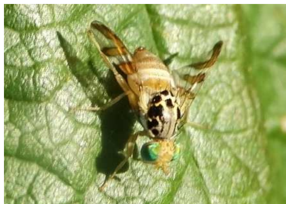
Fig. 1: Melon fly ( Myiopardalis pardalina Big.)

According to the data of the Ministry of Agriculture of the Republic of Kazakhstan, the area of foci of the flies on the territory of the Republic of Kazakhstan is estimated at 13,000 hectares, i.e., about 15% of its potential range of phytosanitary risk (Yskak et al. , 2016).