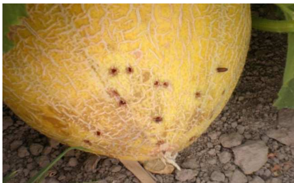
Fig. 4: The transformation of larvae into puparia sometimes occurs when larvae leave the damaged melon fruit