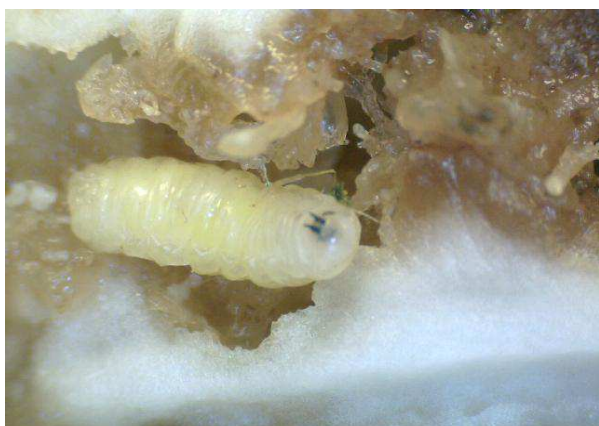
Fig. 3: Larvae of a melon fly inside a damaged fruit