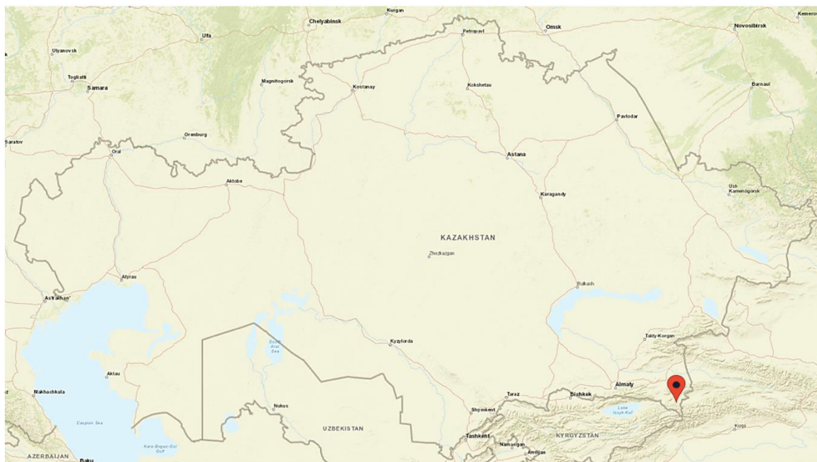
Fig. 1: Map-diagram of the location of the study; Note: 📍 Narynkol forestry municipal state institution, bayynkol forest district

Six sampling areas were chosen for surveys on the Yarmolenko birch forests. According to the descriptions of (Yablokov, 1962), five trees of close age (VI-VII age classes) of each sampling area were selected and marked. When studying the reproductive sphere of birch morphotypes, attention was paid to the parameters of female aglets, seeds, and nuts. At the end of summer (August), after the seeds had reached physiological maturity (yellowing of the aglet cores), at a height of 2.0 to 2.5 m on the west side of the numbered trees, 100 aglets were collected and their length, width, and weight were measured. Then the aglets were dried in a well-ventilated room for 2-3 days, placed in wooden boxes covered with paper, and left for storage at a temperature of 0-5°C (Vetchinnikova, 2004).