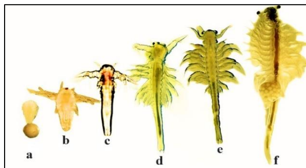
Fig. 1: Development cycle of the crustaceans A. parthenogenetica a, b, c-early stages of development, d-juvenile, e-pre-adult, f-sexually mature

The greatest body length and width are characteristic of A. parthenogenetica (Table 2). At the early stages of development, two species of Artemia showed similarities in the values of morphometric parameters and the average duration of the stage. Artemia nauplii had an unsegmented body with a length of about 386 μm (Figs. 1-2). After 12 h, the crustaceans entered the metanauplii stage. The average duration of this stage of the two species was about ten days. During this period, crustaceans had a body length of 457-463 μm and the first degree of body segmentation. The individuals at the juvenile, preadult, and sexually mature stages are characterized by the presence of new segments and the development of thoracic legs and genital structures. The values of morphometric parameters of the crustaceans A. franciscana showed significant lags from those of A. parthenogenetica at these stages of development. However, the average duration of the development stages of A. franciscana reduced and they reached maturity with a body length of 2599-2732 μm at the age of 19 days. Crustaceans A. parthenogenetica became sexually mature much later at the age of 26 days with a body length of 4250-4400 μm.